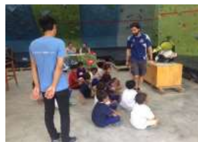
Teaching climbing to the children from the NGO

From Siem Reap, the ACN's children got permission to leave school from their parents and school principals and joined the competition. The expenses of this tour for 17 children were also funded by Taica Corporation.