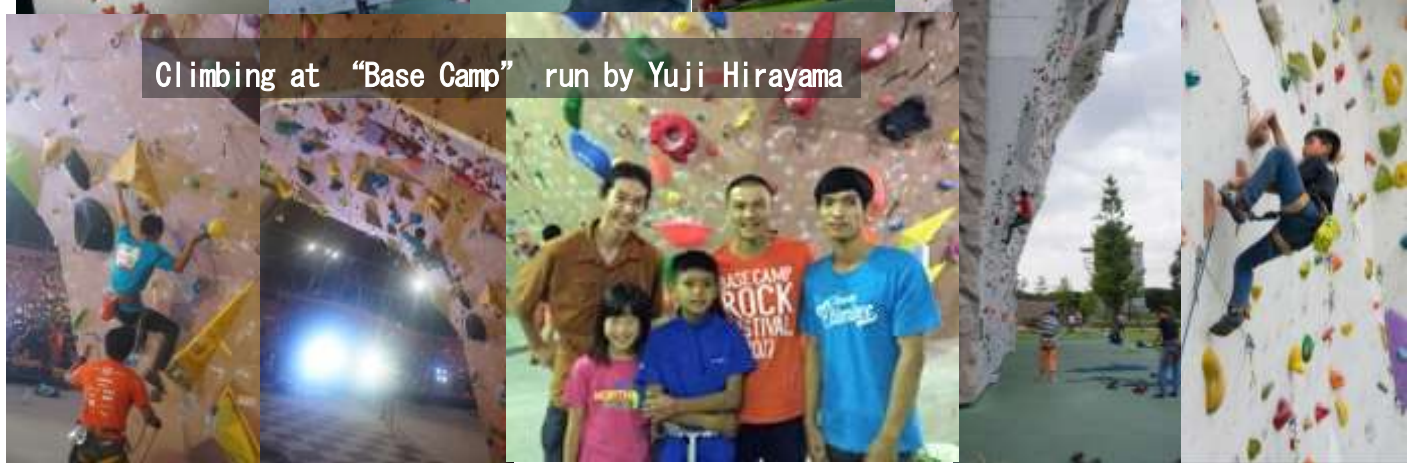
Climbing at "Base Camp" run by Yuji Hirayama