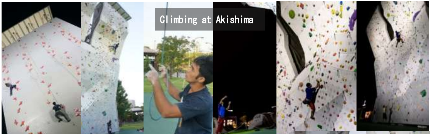
Climbing at Akishima