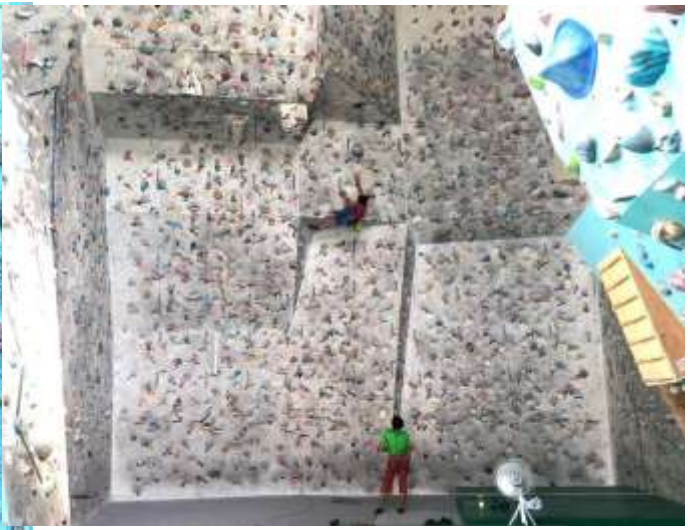
Pull-ups with fingers on horizontal log bars Breakdown practice Yanfai and Channy climbed the eleven-meter high route 100 times