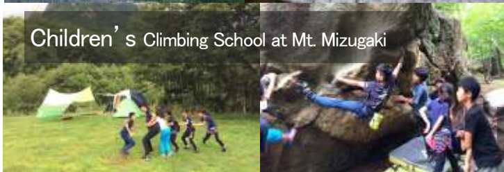
Children's Climbing School at Mt. Mizugaki