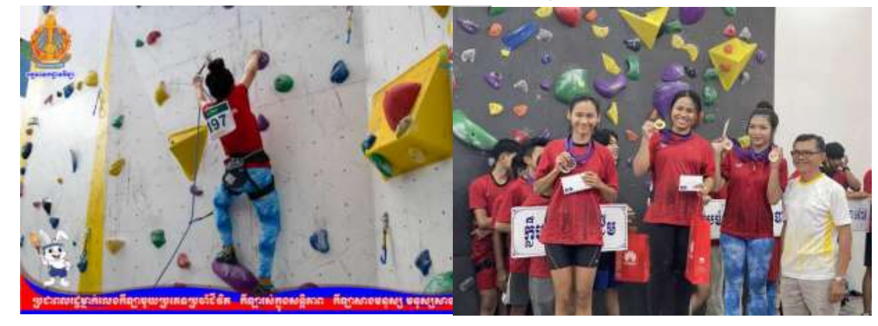
In the lead competition, the situation where "everyone climbs and it becomes a time race" has changed due to the effort of all the setters. Good job!